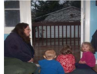
Observing the Rain

how they slept any health concerns, ect. Your child has a clipboard for you to leave this important information. This will help us better care for your child through out the day. If you have any questions please feel free to ask. Open communication is KEY! Thank you, The Baby Room Team