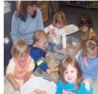
Toddlers + Birdseed = A Hands on Learning Experience