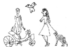
The drawing were created by the 5 year-old children at the Anna Frank School in Reggio Emilia, Italy

On January 8 th all Building Blocks staff members will begin the first of many Professional development trainings on the Reggio Emilia and Project Approach to learning in an early childhood environment.