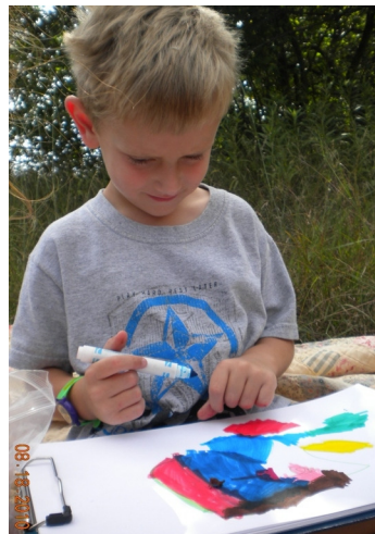
Natalie drew a person with a silk web coming out of it's body.