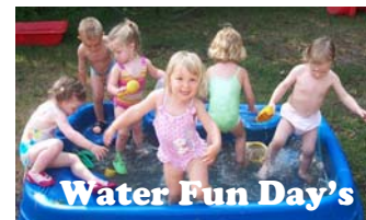
Water Fun Day's