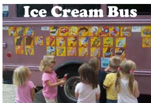
Ice Cream Bus