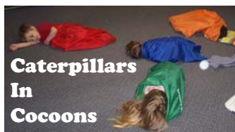
Caterpillars In Cocoons